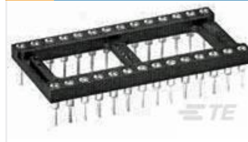
TE Part #4-1437537-0 816-AG11D=SOCKET ASSEMBLY