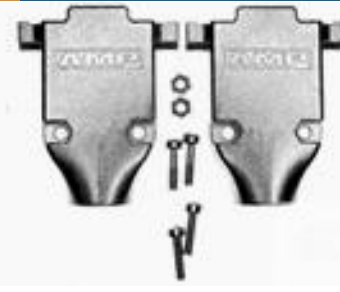
TE Part #5745175-4 CABLE CLAMP KIT,SZ 5